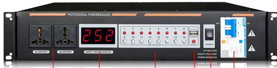
2 way straight socket Voltage display Through switch air switch 16 way indicator/no/off key switch