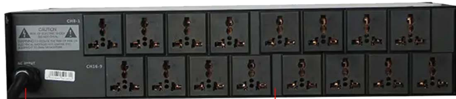
Power cable 16 way universal socket